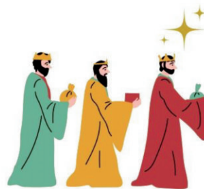
St. Caspar 175 Years

9 a.m. – PREP Parent Class – Abram Room 4 p.m. – Guadalupe Society – North Wing 5 p.m. – Spanish Rosary – South Wing