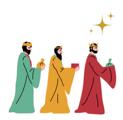
St. Caspar Catholic Church 175 Years