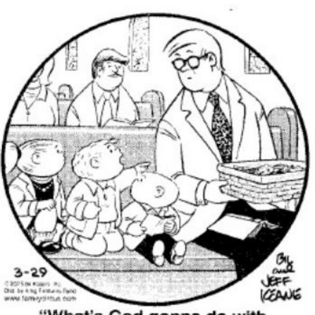
"What's God gonna do with all that money?"